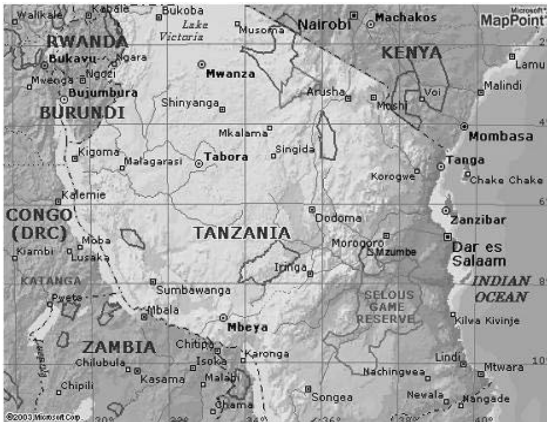
Figure 4. 1: The Map of Tanzania

Tanzania is governed by a constitution with three governing bodies namely, the Executive (consisting of the President who is the Chief of State, a Vice-President and a Prime Minister), Legislative (consisting of the National Assembly for the Union and the House