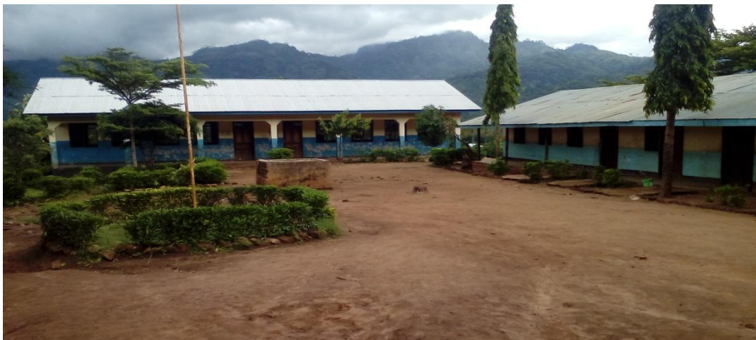
Figure 4.3 Classes appearances of Bondwa primary school

Despite of having beautiful classes the schools lacks water. According to the head teacher there are sufficient water tanks but no water. In the interview session head teacher of Bondwa stated that: ...currently we have water project which is moving, despite that we have sufficient water tanks there is no water, this project is conducted in assistance with the community members (Head teacher, Bondwa primary school: March 2017). Regarding the statement it seems that this project has been started, and it is conducted under the supervision of the village officers.