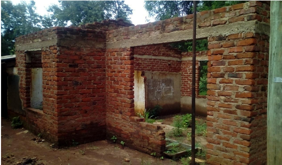
Figure 4.5 Staff building at Kiziwa village