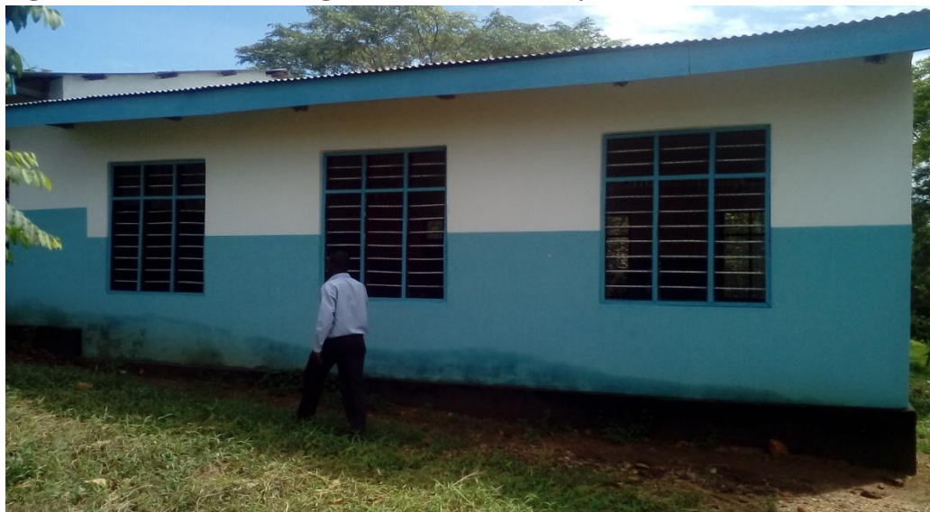
Figure 4.4 Classes building at Kiroka secondary

This implies that, classes' construction projects and toilet construction projects were conducted under SEDP II programme, and that neither the community nor the school management did participate in these projects.