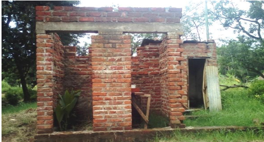
Figure 4.1: Toilet building at kiroka primary school

community members and it seems that members of the community contribute less to these projects. Furthermore the researcher through direct observation observed that toilet building and classes building were incomplete as the buildings have no roof, doors and wall plaster. Figure 4.1 and 4.2 reveals the situation.