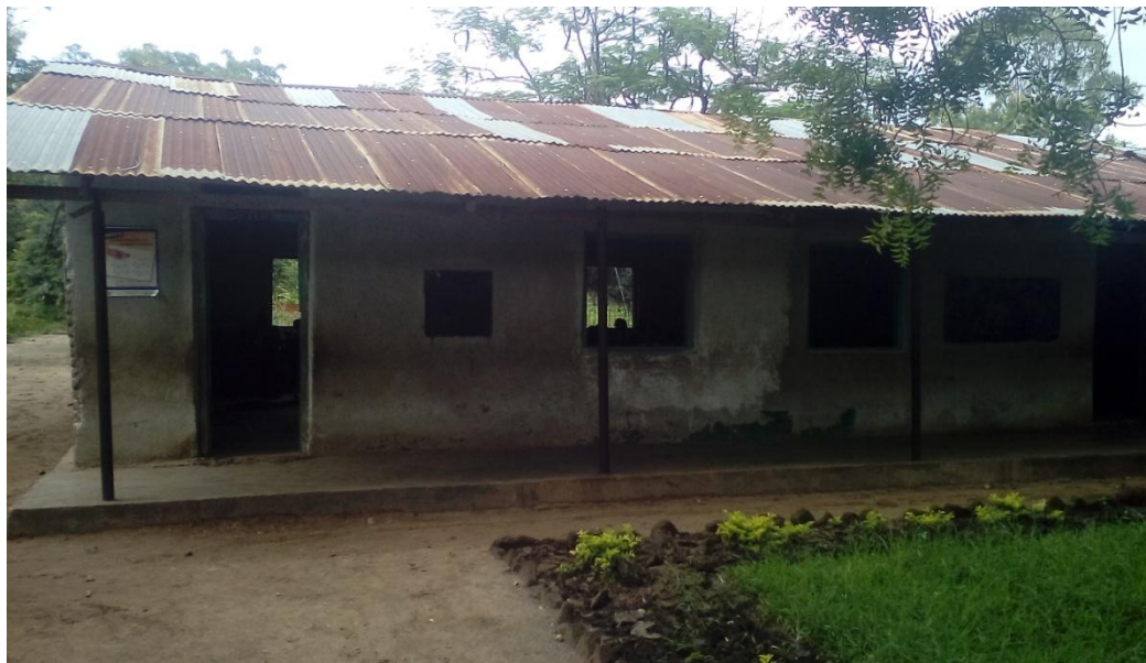
Figure 4.2: Appearances of toilet class building at Kiroka primary school