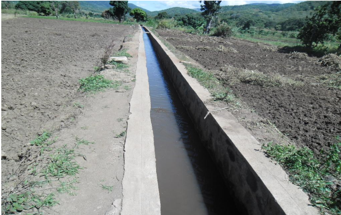
Figure 2.1: The constructed main canals at Lumuma irrigation scheme which convey the water to secondary canals

Semi-arid regions often have higher agricultural productivity if irrigated (Mwakalila and Noe, 2004).