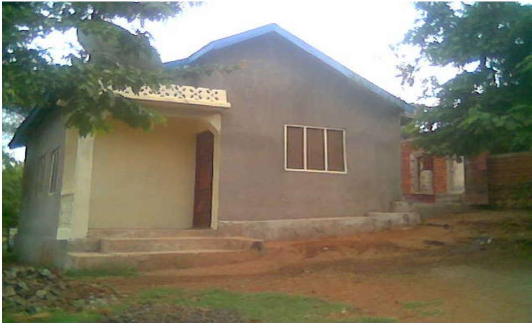
Figure 4.1: The picture showing the improved house of smallholder at Lumuma Village