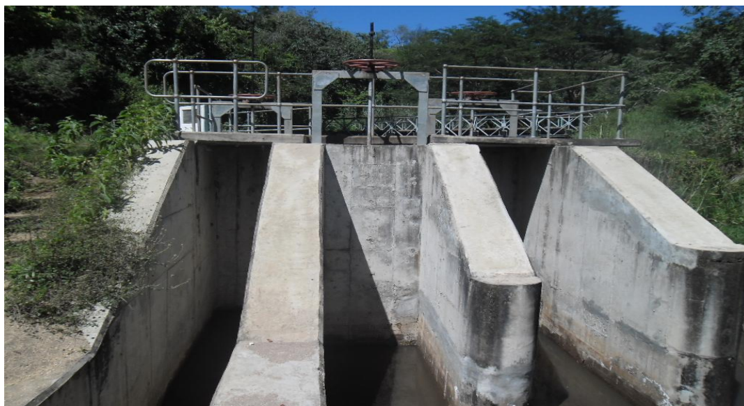
Figure 2.3: Lumuma Irrigation Scheme

The fact that only one male household heads out of twenty male household heads works in town is an indication that the scheme provides gainful employment. From a broader perspective the irrigation scheme is vital in curbing the rural to urban drift.