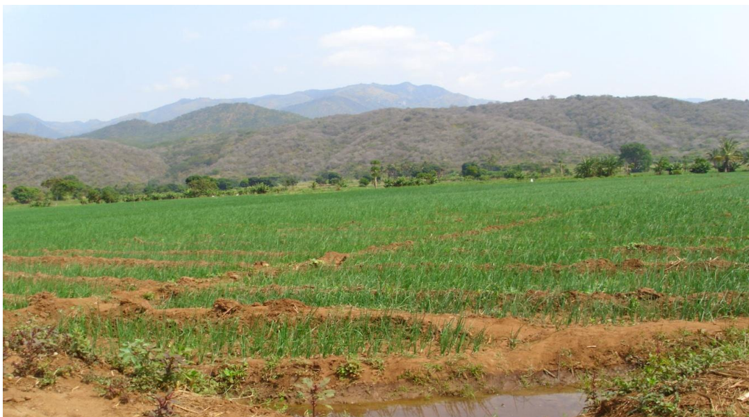
Figure 2.2: A picture of plots with onions at Lumuma valley