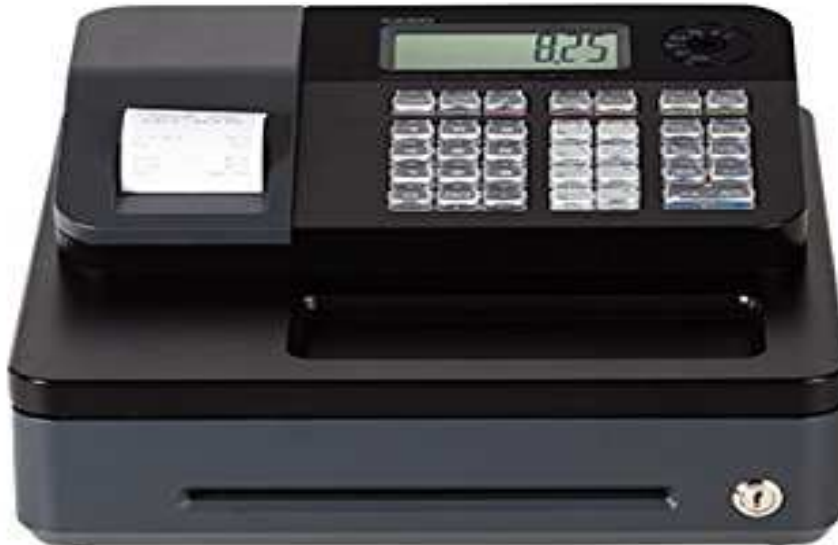
Figure 2.2: Electronic Tax Register

ETRs normally cannot process compensations, or business dealings for returned goods. The devices are tailor made for retail outlets and distributors of petroleum products.