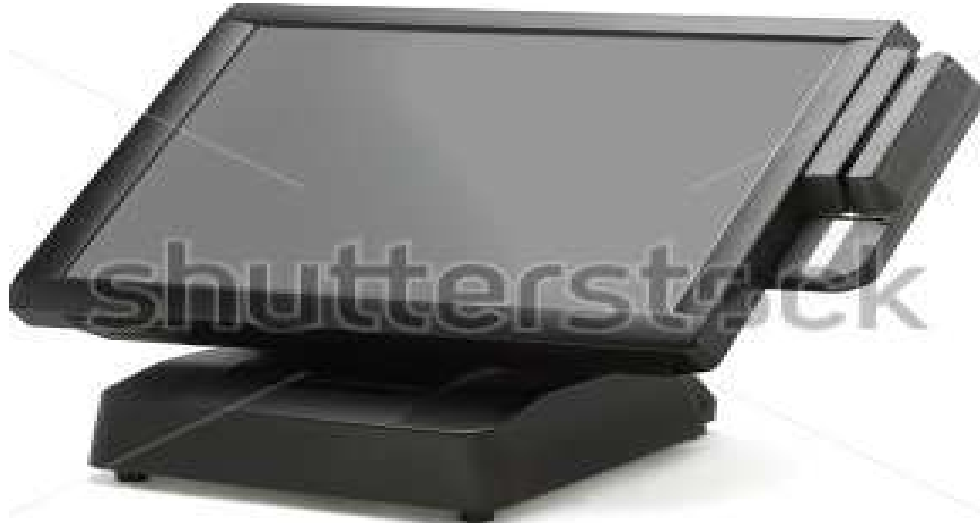
Figure 2.4: Sales Control Devices

The devices are specifically designed for large enterprises. The use of the SCD might be stalled by the requirement of using the ESD, distinguished unique Passwords or code bars provided by the revenue authority or authorized dealers. The requirement for unique identifiable signature depends on acceptability of the community to adopt to the era of fast growing e-commerce.