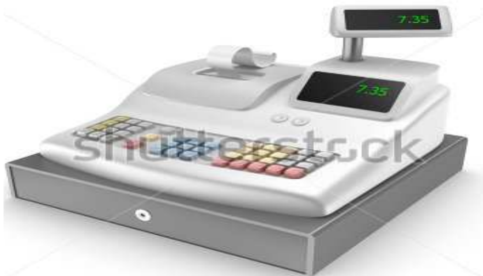
Figure 2.1 Electronic Cash Register