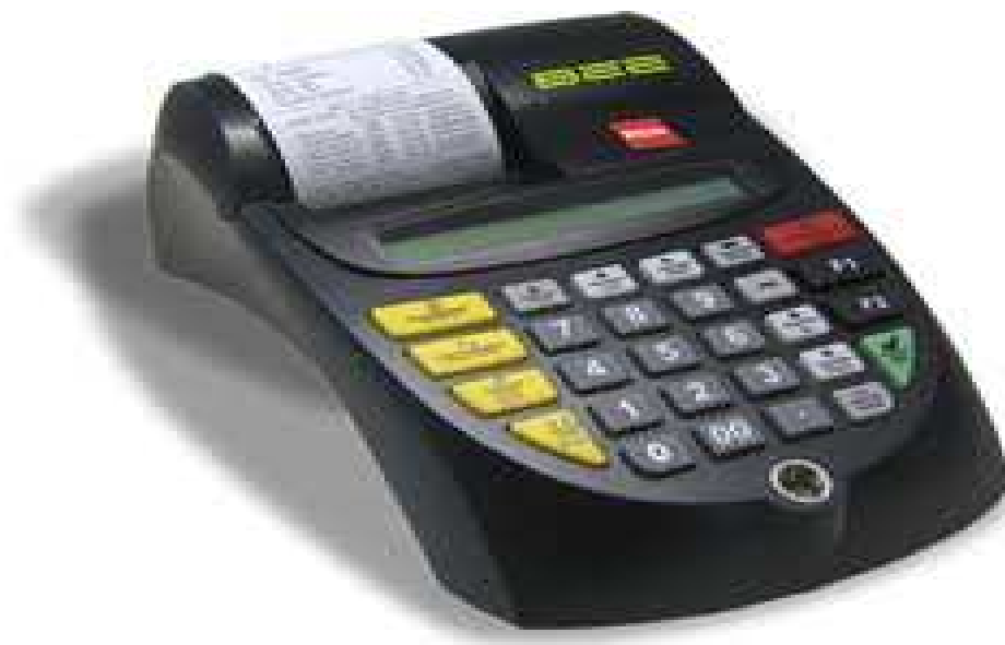
Figure 2.3: Electronic Fiscal Printers

Electronic Fiscal Printer is not a stand-alone device, it is a supplement of other types of sales recording devices. For example it is connected to an existing ECR to issue a receipt.