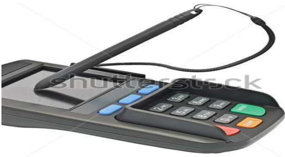
Figure 2.5: Electronic Signature Devices

The ESD require separate devices to record the sales information hence it is not a stand-alone device rather a dependent one. It works hand in hand with the EFPs. ESDs are mostly suitable in medium-sized business or retail situations where there is a likelihood of returned scales.