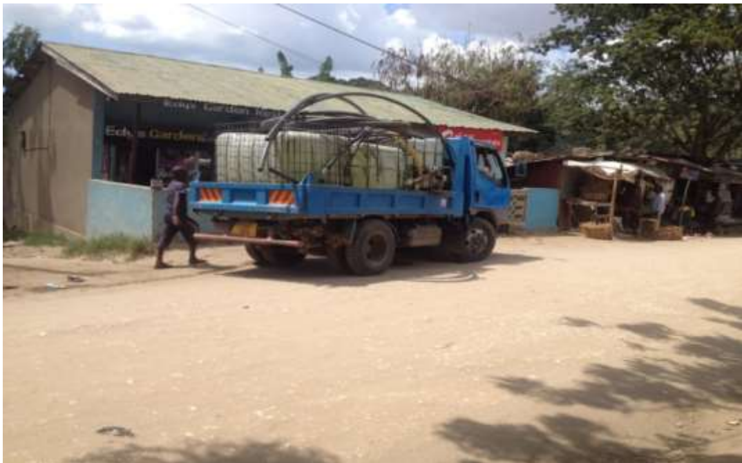
Figure 4.2 shown the mobile water vendor selling water in Kimara, Dar es salaam