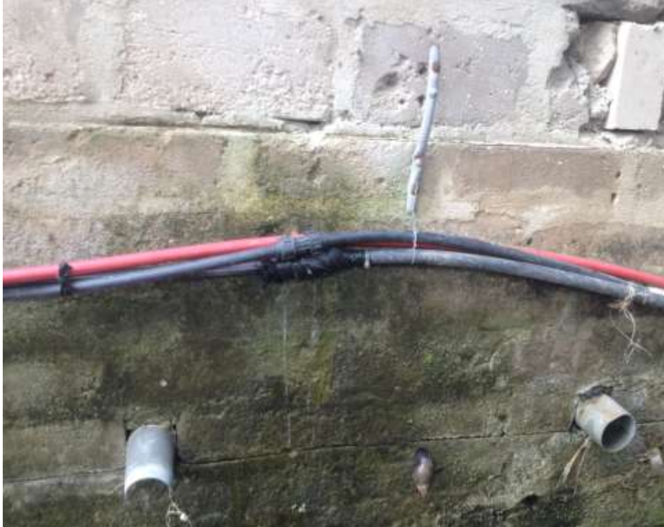
Figure 4.4 show the water likage in ubungo msewe which caused by poor water infrastructure